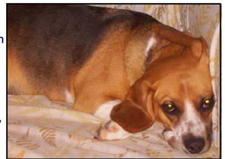
Overweight and unhappy, it was dear Pippa was unsuitable for re-homing