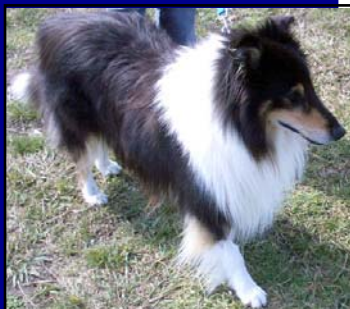
Wellington was matched up with an ideal family by Victorian Collie Rescue

He was dumped at a pound in A.C.T and was on “death row” when Collie Rescue found him. They quickly adopted ‘Zac’ and placed him in a nearby foster home.