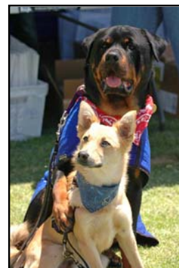
Bring a friend and their dogs to any of the Companion Dog Club events

All Walk and Talks at 6:30pm at the KCC Park.