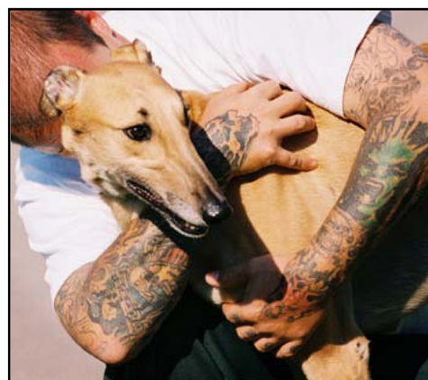
A Greyhound gets a cuddle from its in-mate foster carer at Dhurringile Prison.

Dhurringile Prison in Victoria's north. The Prison Pet Partnership, an extension of Victoria's Greyhound Adoption Program (GAP), is an (Continued on page 2)