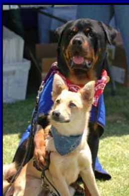
Bring a friend to any of the Companion Dog Club events

Renew within your anniversary month to get a bonus voucher from Purina Pro Plan.