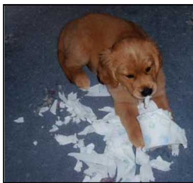
Polite behaviour must be taught. Dogs have no sense of right or wrong.

A problem behaviour is akin to a bad habit and can be 'broken' with appropriate obedience training.