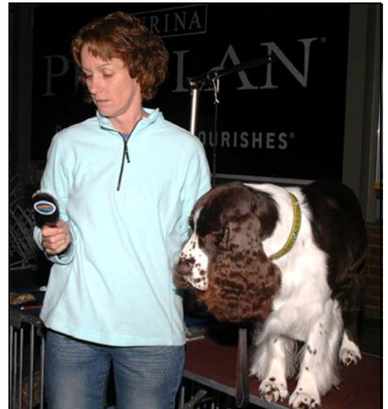
As you brush, feel your dog's skin.