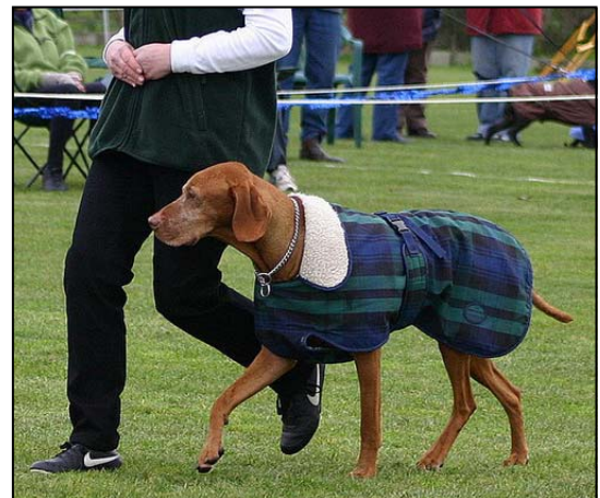
Try using let's go! instead of heel!

If you think there is room in your life for an adult rescue dog, visit the CDC Adoption Directory .