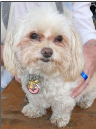
An all-over rub down is a great way to begin a grooming session.

An all-over rubdown is a great way to begin every grooming session. It loosens dead coat, increases circulation in the skin, relaxes your dog for grooming – and it's also an important skin check. Lumps, bumps, rough patches, sores, or bare spots in the coat may be missed if you aren't actually putting your hands on your dog in a methodical way. This is also an excellent way to determine whether