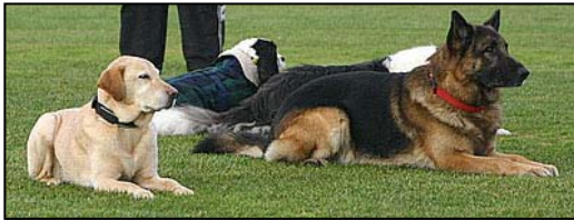
Use relax instead of down and wait instead of stay .

older dog can be trained? Or do you already have an adult dog who's just never gotten the hang of obedience commands?